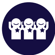
ENJOY AND ACHIEVE