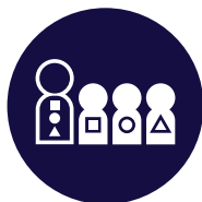
KNOW OUR CHILDREN WELL

At Carr Manor Community School we have four key values that ensure every child can achieve the best possible outcomes: