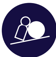
CHARACTER FOR LEARNING